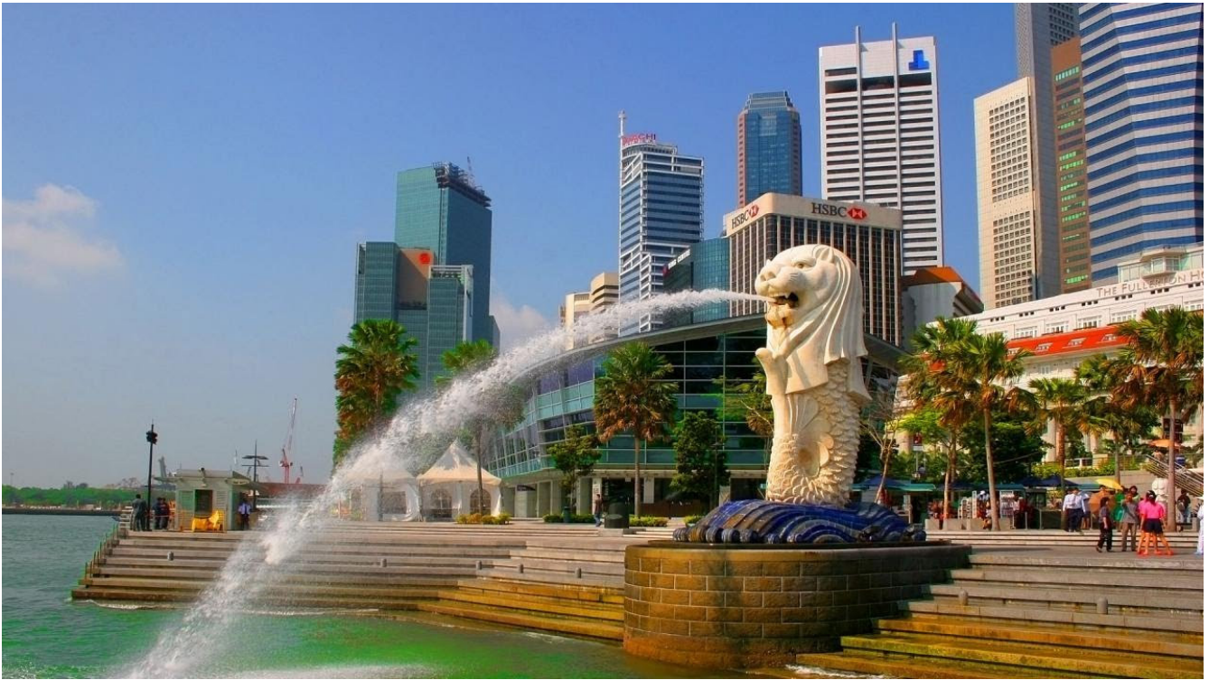
The skyline of Singapore, which Oxfam has found to be the fifth worst corporate tax haven in the world.